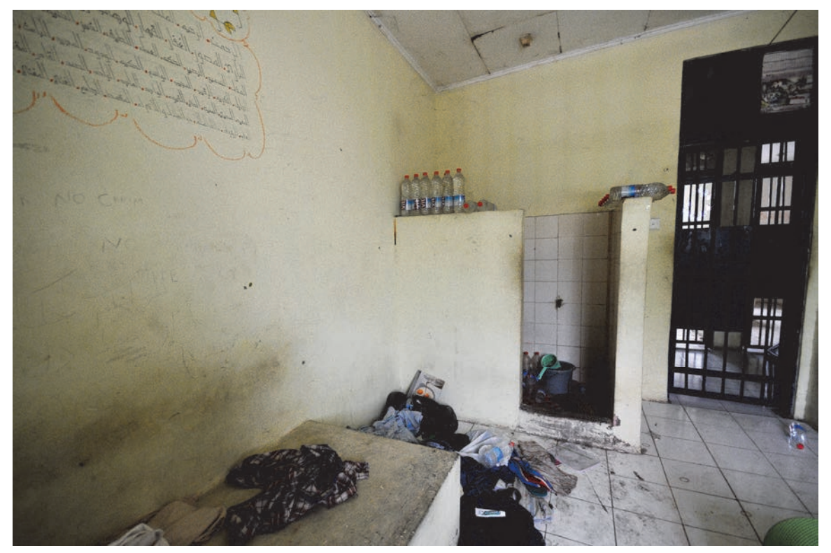
A cell at Kalideres Immigration Detention Center near Jakarta. Detainees reported that living areas were unsanitary and that they frequently lacked adequate water, bedding, and mattresses.

Migrants reported poor sanitation facilities and insufficient amounts of water for drinking and bathing in a variety of detention facilities. A girl age 17 interviewed at Belawan IDC reported, "It's difficult for girls to have a bath. There is no privacy. Our window got broken in the bathroom so we have to cover it with some cloth to have privacy now."<sup>203</sup>