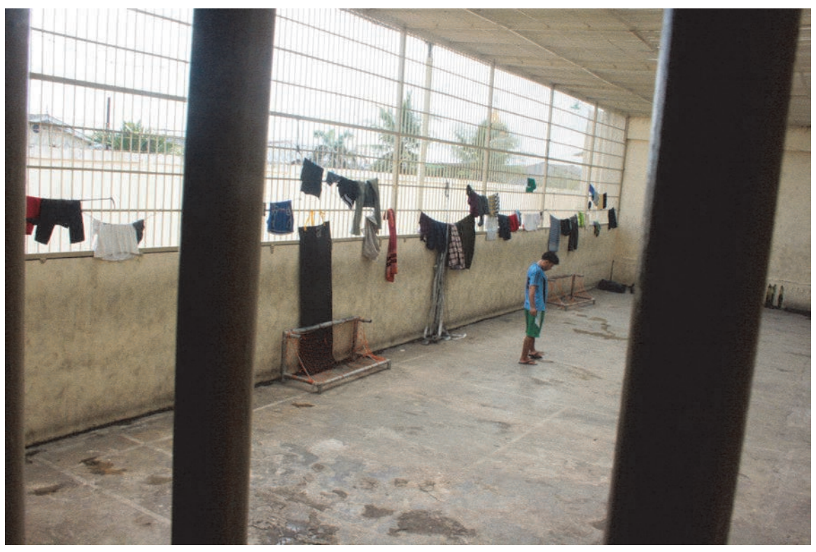
An Afghan asylum-seeker walks in the courtyard used for outdoor recreation time at Belawan Immigration Detention Center, September 2012. Some interviewees reported being held for months without access to recreation spaces.

According to our interviewees, access to recreation seemed to be at the whim of immigration staff. Faizullah A., also from Afghanistan, was 17 years old when he was detained for seven-and-a-half months at Pontianak IDC: