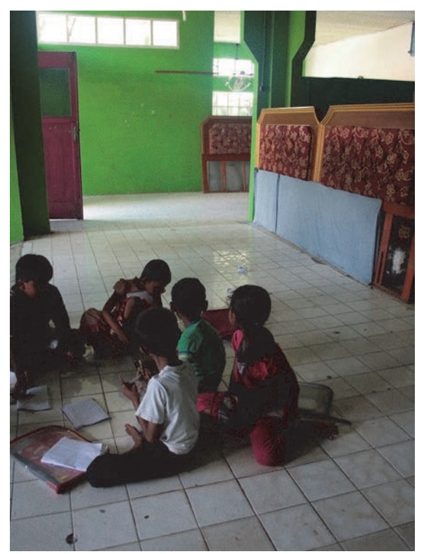
Rohingya children seeking asylum with their families attend an English class sponsored by the International Organization for Migration at a living center for asylum seekers in Medan, September 2012.

[I]t's not good. We cannot go to school because we are refugees.... The Indonesian government doesn't make it possible for us to live here. I want to study maths, English, and science ... I can do that when I leave here.<sup>257</sup>