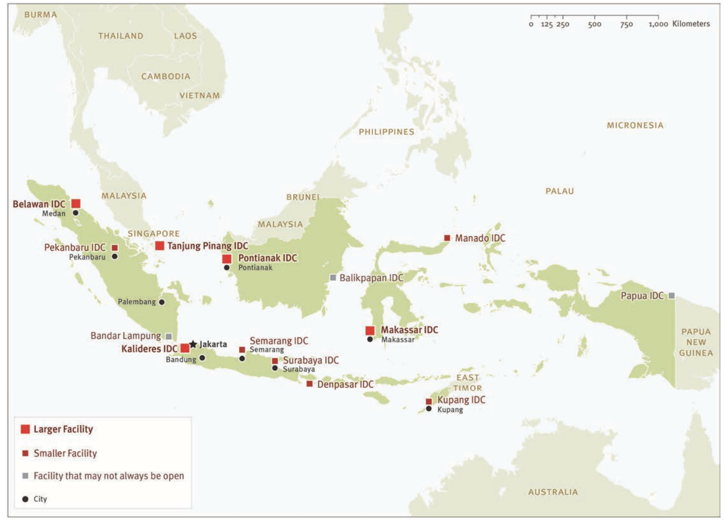
Indonesian immigration detention centers.

Migrants interviewed by Human Rights Watch, including children, reported being held in a number of alternate facilities in addition to the IDCs. Regional immigration offices, including those in Medan, Denpasar, Padang, and Jakarta, have holding rooms or cells, which typically are used to hold migrants for short periods of time (our interviewees who were held in these facilities referred to periods of time less than one month). In addition, Indonesian authorities use hotels or other buildings, with guards (sometimes from the Directorate General of Immigration, and sometimes from the police), to hold groups of migrants for short periods. The total number of informal facilities used to detain migrants is hard to know, as different facilities are open at different times.