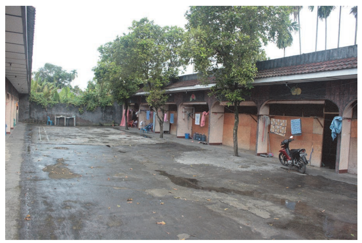
Living center for asylum seekers and refugees in Medan, northern Sumatra. Even once released from detention, asylum seekers and refugees must live in certain areas and cannot move freely about the country. Families living here reported flooding, overflowing sewage, and concerns about neighborhood crime.